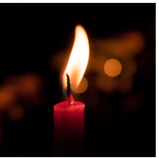
Andres F Uran

I have a friend who shouts, 'Team Time' before everyone leaves the house in the morning. They all gather in a huddle to say a short prayer for the day ahead. The other day, I heard about some siblings in their twenties who have left home but still automatically shout 'Team Time' before setting off on a journey or leaving to meet a difficult challenge that day.